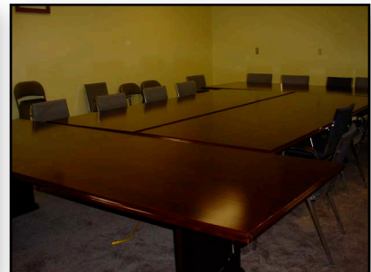
Indoor Conference Room